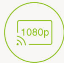
1080P Live Streaming