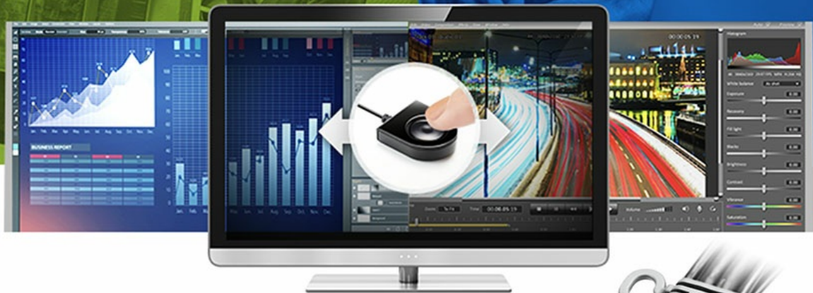
CS52DP ▶ 2-Port USB-C DisplayPort Hybrid Cable KVM Switch